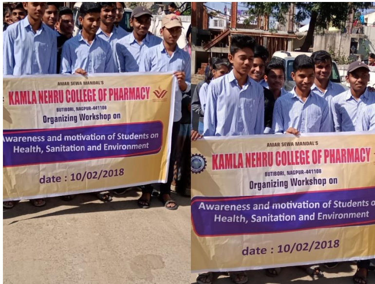
Photo 9: Awareness and motivation of Students on Health, Sanitation and Environment